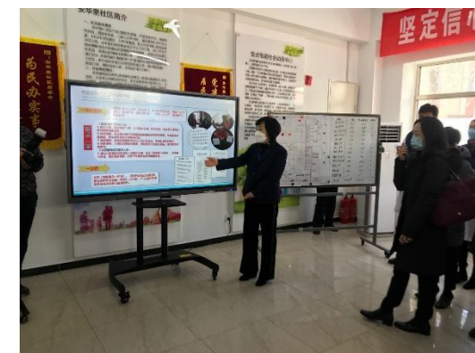
Contact monitoring and case finding