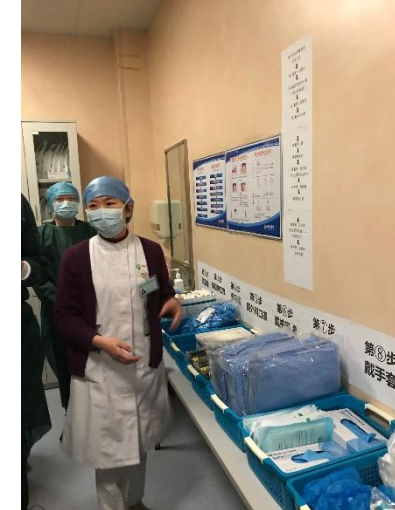
Infection, prevention and control