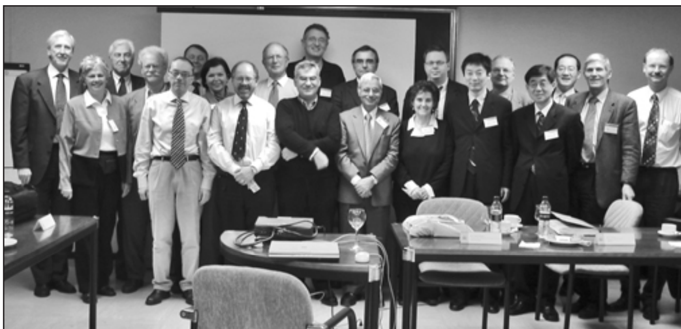
IAEA Steering Panel Committee

Digital fluoroscopy and rotational angiography also requires special attention for patient radiation protection. With the new fluoroscopy systems, images are acquired very easily, resulting in sometimes a large number of unnecessary images. Different fluoroscopy modes, with very